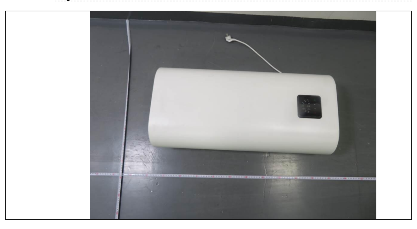
Details of: Fig.2.