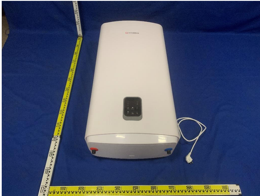
Fig. 1 – Overview