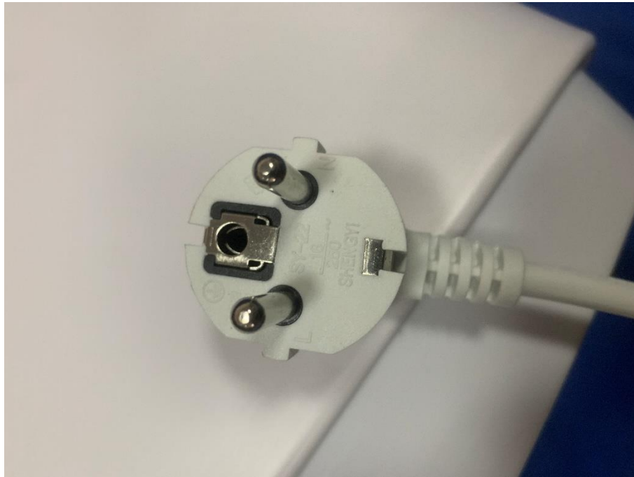
Fig. 3 – Plug view

The result(s) shown in this report refer only to the sample(s) tested. Without written approval of AOCE, this report can't be reproduced except in full.