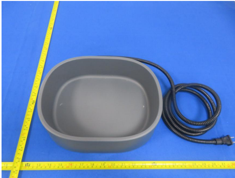
Figure 1 Overall view_1 of PG-0521