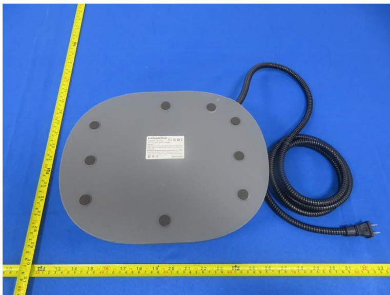
Figure 2 Overall view_2 of PG-0521